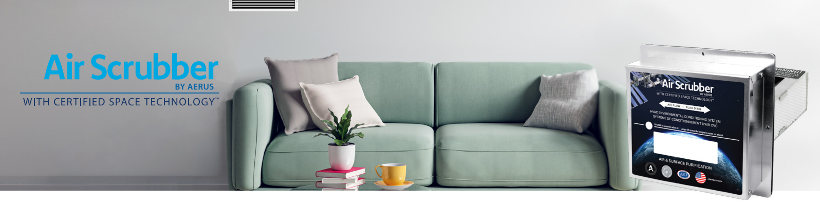
New Patented Cell Design